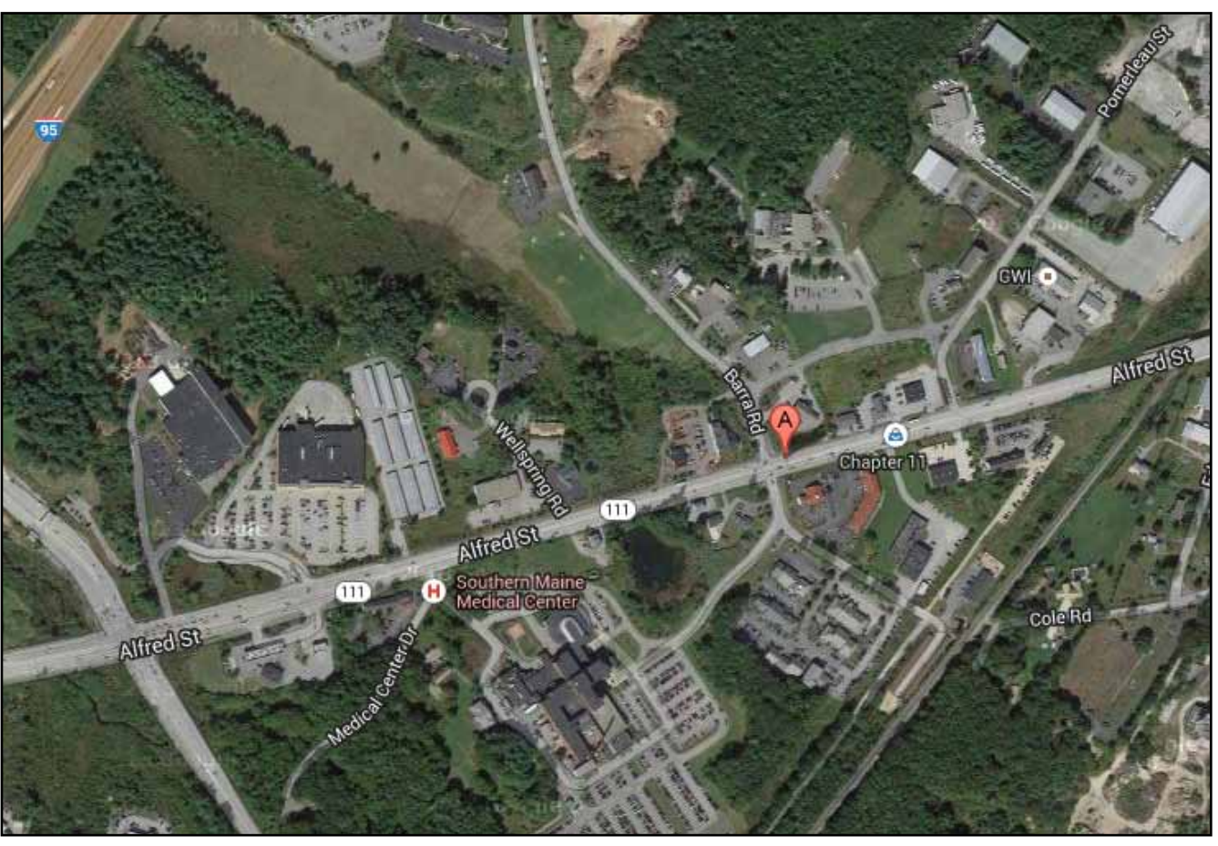
Traffic Count SR 111 (ALFRED ST) E/O ME TURNPIKE ENT 24830